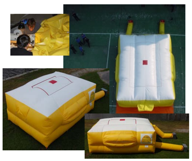
Many have copied but none have perfected!

At the present time, our Safety Air Cushions are being used across the United States and in several foreign countries, by fire & rescue departments and Hollywood for highrise movie stunts. Many fire departments and emergency squads in such places as New York, San Francisco, Las Vegas, Los Angeles, New Orleans, Tokyo, Hong Kong, Chile, Rio de Janeiro & Macau, China, and many others, have found our product to be an extremely valuable asset in both training and emergency use.